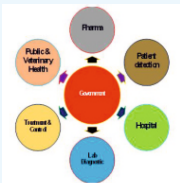
Fig. 3: Model diagram showing how the Indian government is involved in bringing One Health aspects together to combat black fungus infections.

For the first time in India, veterinary research laboratories are actively working with medical doctors in collective response efforts, recognized as the most significant One Health activity in the country with the support of the government (Figure 3). They are jointly diagnosing COVID-19 by RT-PCR and promoting regular surveillance and stringent measures for disease control. These approaches include air disinfection systems, ventilation systems, the use of high-efficiency particulate air (HEPA) filters for high-risk wards, closing the windows, control of entry and exit doors, and the control or complete elimination of flowers brought into hospitals