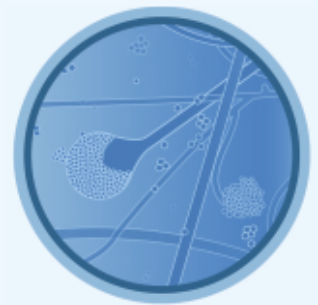
Fig. 2: Mucormycetes.

Black fungus infection or mucormycosis is an opportunistic fungal infection that interrupts the blood supply to normal tissue that becomes black due to necrosis, hence the name "black fungus". Mucormycosis occurs in humans as well in domestic and wild animals (cattle, sheep, cats, dogs, cows, horses, dolphin, bison, and seals). The types of opportunistic fungi that cause mucormycosis include several species that are found worldwide: Mucor irregularis , Rhizopus homothallicus , Syncephal astrum , Cunninghamella bertholletiae , Apophysomyces variabilis , and Litchthemia spp. (formerly called Absidia ). Rhizopus oryzae , R. microsporus and Apophysomyces variabilis have been reported in India. R. oryzae (Fig. 2), the most common type of black fungus, is responsible for nearly 60% of mucormycosis cases in humans and accounts for 90% of the rhino-orbital-cerebral (ROCM) form in India. 6