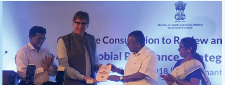
Release of One Health AMR Action Plan (KARSAP) by Chief Minister of Kerala

In addressing issues such as AMR, it must be recognized that the drivers for this complex issue lie across domains encompassing human health, animal health, environment, fisheries and water sanitation, hence can only be resolved through intersectoral Action Plans, which are cornerstone for action by the State. In India, only three states (viz. Kerala, MP and Delhi) have developed a Strategic Action Plan based on National Action Plan against this silent pandemic. Kerala was the first state in the country to have ramped up efforts to control AMR, and this plan was guided by WHO and was launched by the Chief Minister of Kerala in October 2018. The state plan is called Kerala AMR Strategic Action Plan (KARSAP) and has been operationalized through a One Health response which was formulated under the leadership of the Health Minister Ms K KShylaja.